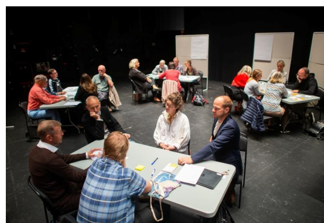
Ambassador workshop in Karlskrona, Sweden, 2018