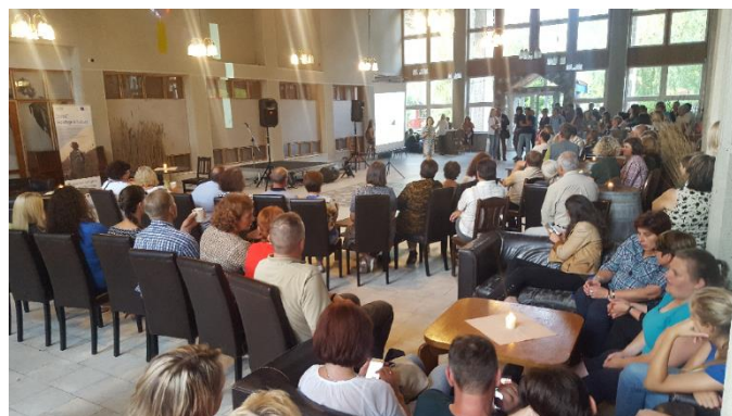
State Service for Protected Areas, Lithuania, 2018

The result of the meeting was a decision to create a “working group” of approx.. 5—10 members who will discuss and generate the main values,, criteria and responsibilities of ambassadors. The CSNPA organised two working group meetings (Nov’ and Dec’) at which the guidelines for ambassadorship will be developed. At present the ambassador group consists of 5 local members – a municipality employee, a local photographer, an artist, an ensemble member and in an administrative role – the CSNPA, but it will be open for anyone to join at any time. It is an informal group, which wants to share ideas about ambassadorship in the Curonian spit. With the help of the active members we aim to create a strong ambassadorship campaign and to establish links with other South Baltic UNESCO ambassador networks.