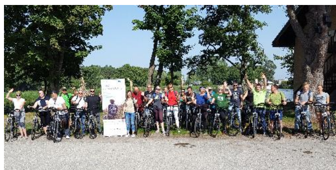
Bike Trip, Lithuania, 2018

In August, CNSPA represented DUNC at the meeting of members of the 'State Service for Protected Areas' under the Ministry of Environment. 160 members from all kinds of different organizations from all over Lithuania including 30 organizations associated with protected areas attended. This annual event was a great opportunity to promote DUNC and our goals. We realised our aim which was to create an informal platform for discussion on seasonality challenges and possibilities for new cycling infrastructure. CSNPA organized a bike trip through Curonian Spit with some of the event participants. Which led to good ideas being shared on how we can improve biking activities. During this unusual and informal meeting, the decision was made that Nagliai strict nature reserve is the best place for a bicycle oriented product. It was decided that there was a need to improve cycling infrastructure in this natural area. We will now look at the development of an innovative cyclist product. CSNPA now has a wider overview on these topics, which it can share with other WHS, within the DUNC framework.