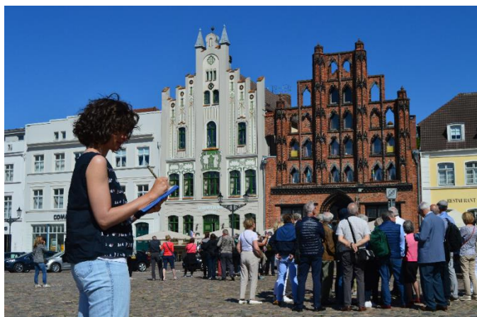
Wismar Market Place, Germany, 2018

video games; 3) reconstructing the historical past with the help of augmented reality tools; 4) relishing the imagination of the visitors.