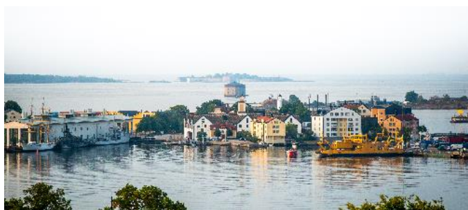
Karlskrona View, Sweden, 2018