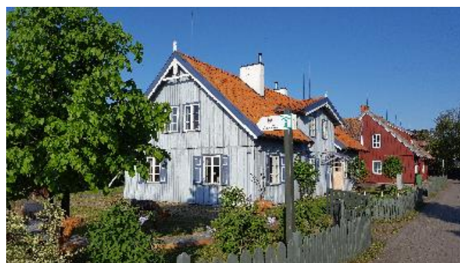
Nida, Lithuania 2018