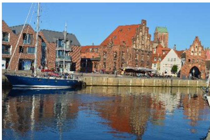
Wismar Harbour, Germany, 2018