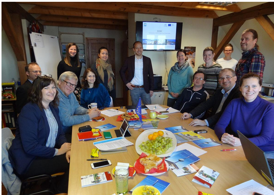
The DUNC Team, Nida 2017.