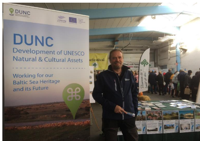
At the cheese festival Mörbylånga, Sweden, 2018

theme of the 3-day meeting was 'Creatively Looking Forward' with the aim to jointly decide upon ideas for new sustainable touristic products & services that are to be piloted & developed in-line with DUNC objectives. Mörbylånga introduced three potential products including World Heritage food and tea/coffee 'Fika' events plus cookbook which we will now investigate further.