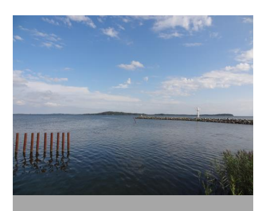
Inception WS Part 2

Cross-border sustainable tourism strategies can be integrated into site management plans. DUNC team examines the possibilities for Baltic Sea UNESCO World Heritage.