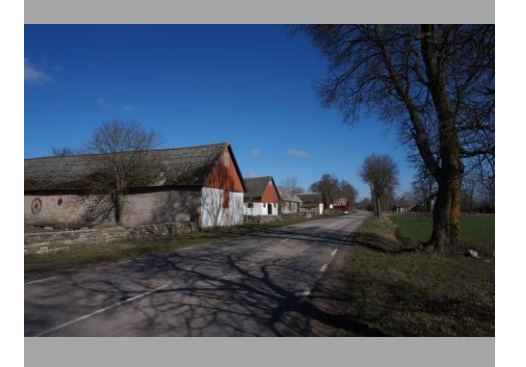
Inception WS Part 3

Cross-border sustainable tourism strategies can be integrated into site management plans. DUNC team examines the possibilities for Baltic Sea UNESCO World Heritage.