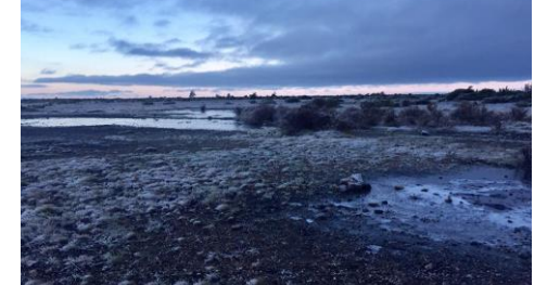
Working for our World Heritage & the Future

Integration of sustainable tourism with cultural heritage conservation